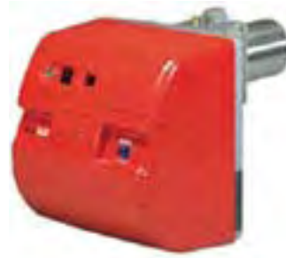
Riello 28 oil fired burner

Also prior to this date the 800 & 1000 models (later called 235 & 275) were fitted with 12 smooth turbulators (see diagram).