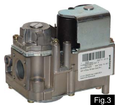
Fig.3 Honeywell VK4105C(A) AmbiRad no. 202658 (202657)

Burners fitted with the new Honeywell valve will be labelled with generation code: AB so that the valve can be identified for spares purposes. Example burner label shown below: