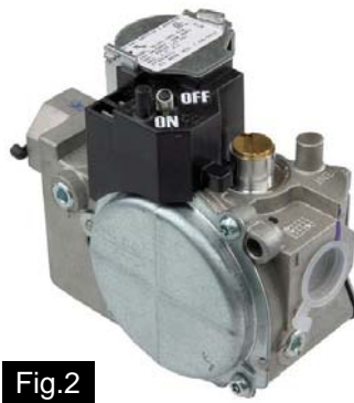
Fig.2 White Rodgers 36J AmbiRad no. 202404 (202528)