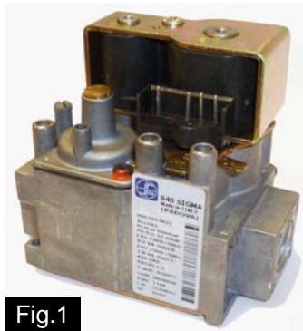
Fig.1 SIT 840 Sigma AmbiRad no. 201857 (201914)

Due to on-going improvements, the gas valves fitted to the Vision range of radiant heaters are being changed from the current SIT valve (Fig.1) and White Rodgers (Fig.2), to the new Honeywell valve (Fig.3). The new valves are suitable for Natural gas part no. 202658 and Propane part no. 202657.