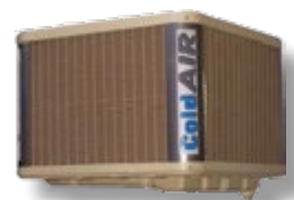
Roof top model RA