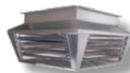
4 way diffuser box