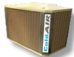
Wall / window model WA