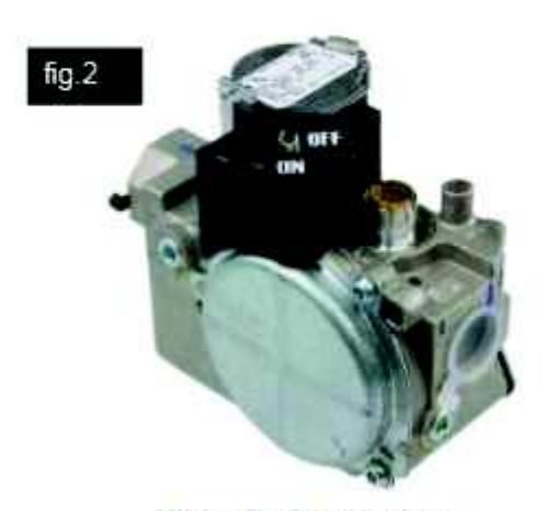
White Rodgers valve